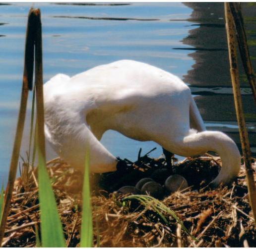
Figure 4. Female Trumpeter Swan stirring her eggs.

The timing of nest building relative to physiology is of interest. Using Grau's (1976) technique for measuring rapid yolk development, I found that Mute Swan yolks took \bar{x} 9.17 \pm 0.44 days (range 9-10, N=6) to develop in the ovary before the follicle ruptured and the yolk entered the oviduct (Lumsden, unpublished). It is assumed that yolks of Ontario Trumpeters have a similar speed of development. If we allow two days for albumen, membrane and shell deposition, RYD would begin about 11-12 days before laying (see also Alisauskas and Ankney 1992). Most clutches (63%) in Ontario were initiated during 21-30 April (Lumsden 2016). RYD would have begun about 10-18 April. I have seen nest building behaviour as early as mid-March in years when the first eggs appeared about 1 April. Thus it seems that Trumpeters start nest building just before RYD begins.