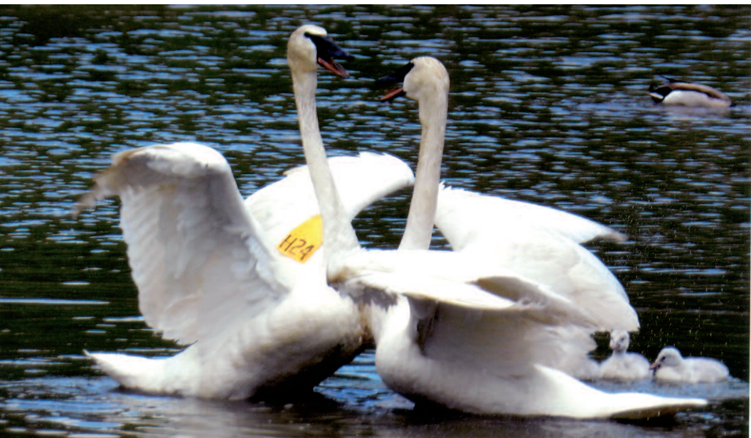
Figure 5. Wing quivering display in defence of brood.

There was a totally different response from H24 when I again confronted him at close range when he was guarding his 15 day old brood. He threatened me with curved neck, lowered head and wings raised but unspread primaries. He vigorously shook his wings (Figure 6). Note in