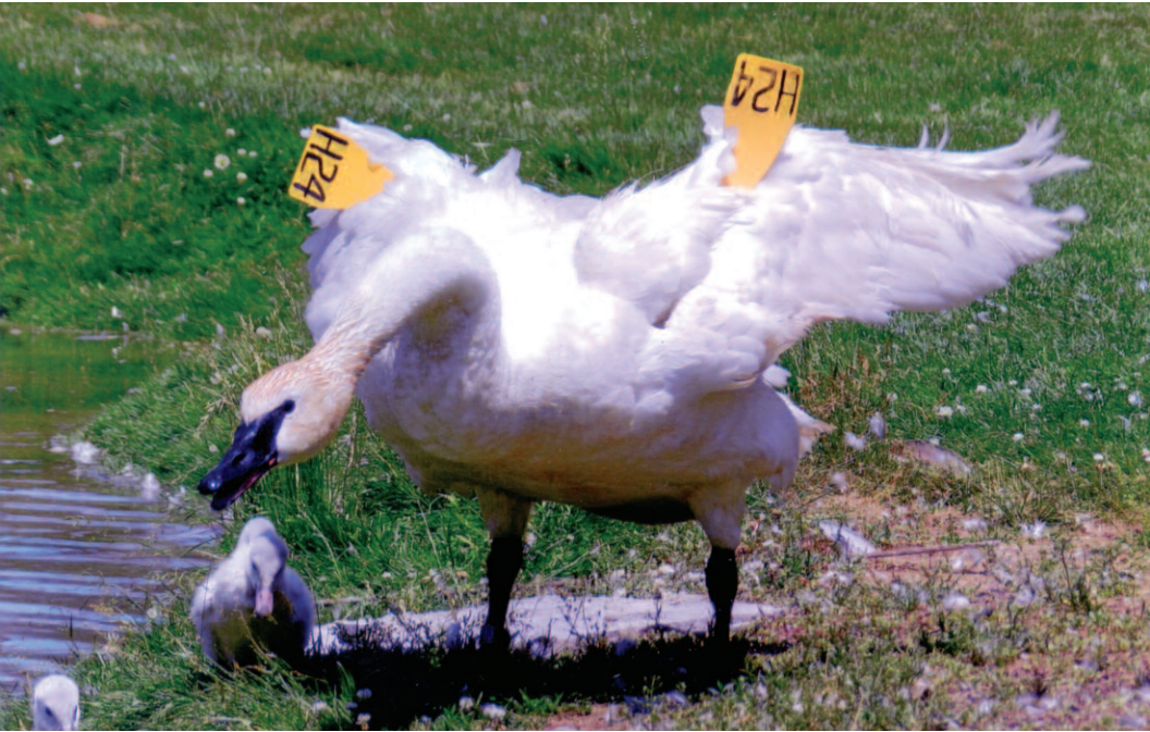
Above: Figure 6. Wing rattling display in defence of a brood.