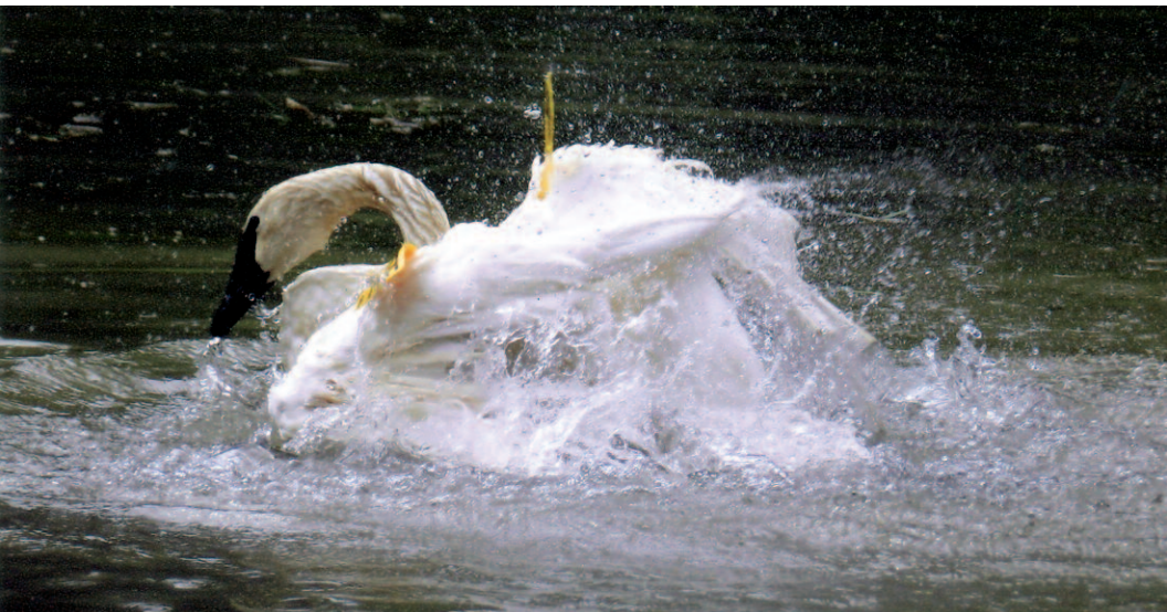
Figure 2. When bathing, the swan thrashes the water with its wings.

Trumpeters bathe frequently but particularly after a fight and after copulation.