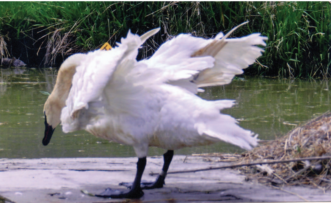
Figure 3. When drying after bathing, the swan vigorously shakes its wings.

All species of swans and geese seem to have a deep seated aversion to making physical contact with one another, in particular Trumpeters and Canada Geese ( Branta canadensis ) (Lumsden, pers.obs.). They do not allopreen (i.e., preen other individuals) and they strictly maintain individual distance (Conder 1949), which develops in the brood period and prevails throughout life. The only exceptions occur in courtship and copulation and when females brood cygnets. Swans ensure physical isolation by threat when another swan approaches within a body