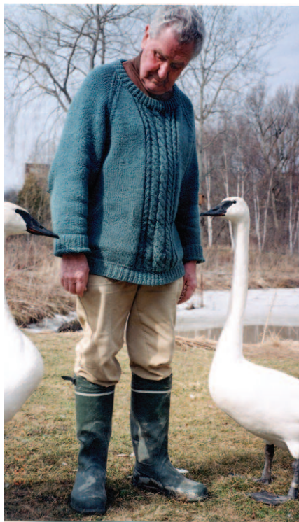
Figure 1. Female Trumpeter Swan (bird on the right) that courted by pressing her breast to the author's thigh.