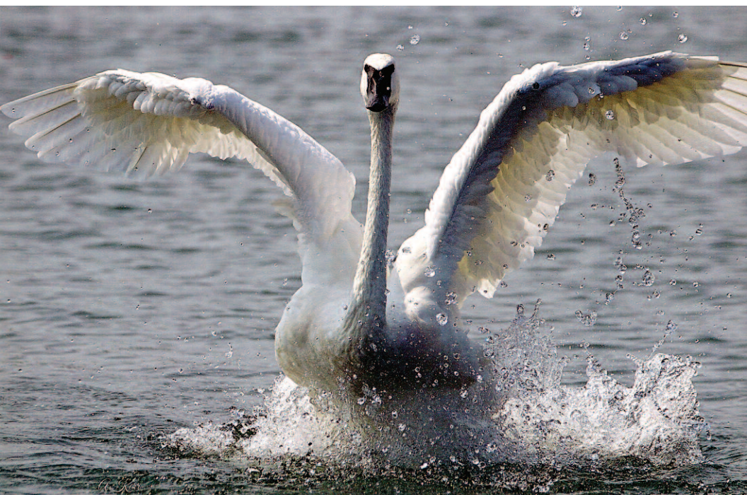
Above: Figure 8. Wing flap display. A threat with vigorous stamping.