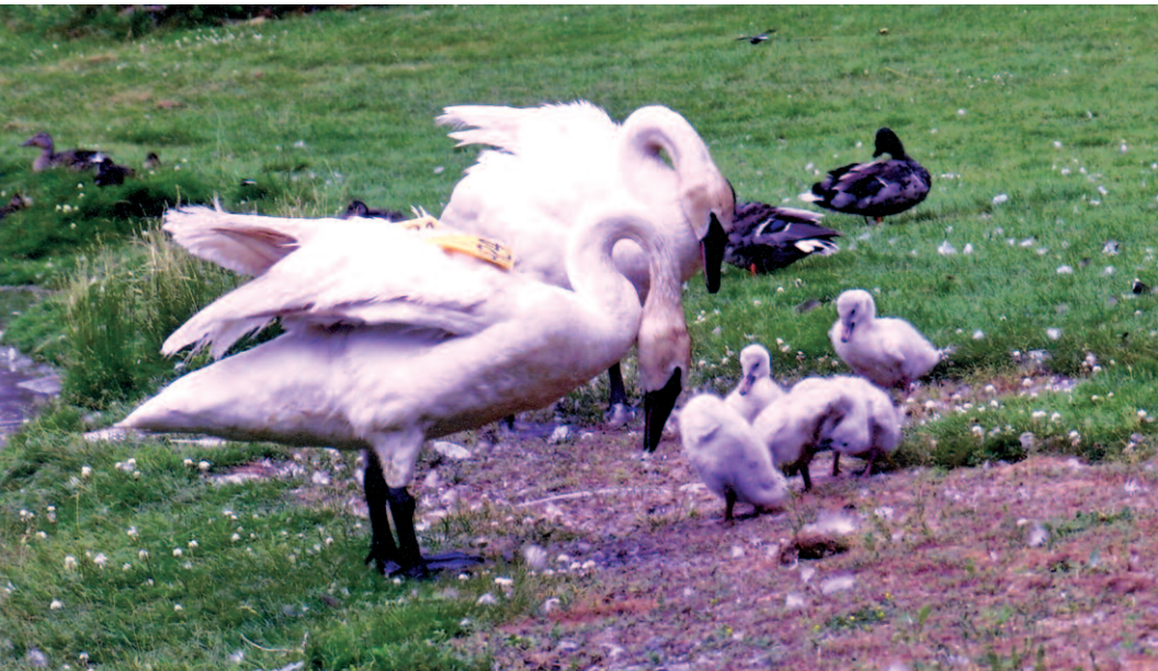
Below: Figure 7. Curved neck display in defence of a brood.