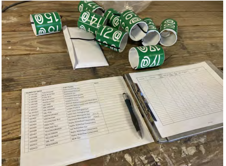
Above: Leg and neck bands were put on the swans before release. Each band is unique to the swan. The band codes and other information were recorded and will be part of the official record of each swan.