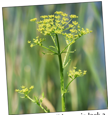
The flowers of wild parsnip look a bit like dillweed.

“Roadside plants are the gas stations, hotels, baby nurseries, grocery stores, rest stops for our birds, insects, butterflies and countless other species,” says Margaret. “These narrow corridors help wildlife survive, thrive and travel safely to larger habitats.”