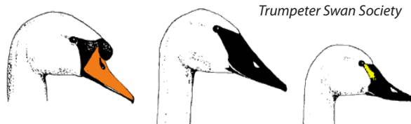
Mute Swan Trumpeter Swan Tundra Swan

The most notable difference between the mute swan and the two native swan species found in Michigan (trumpeter swan and tundra swan), is that adult mute swans have orange bills.